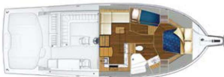
Main Cabin with Two Staterooms (Optional)