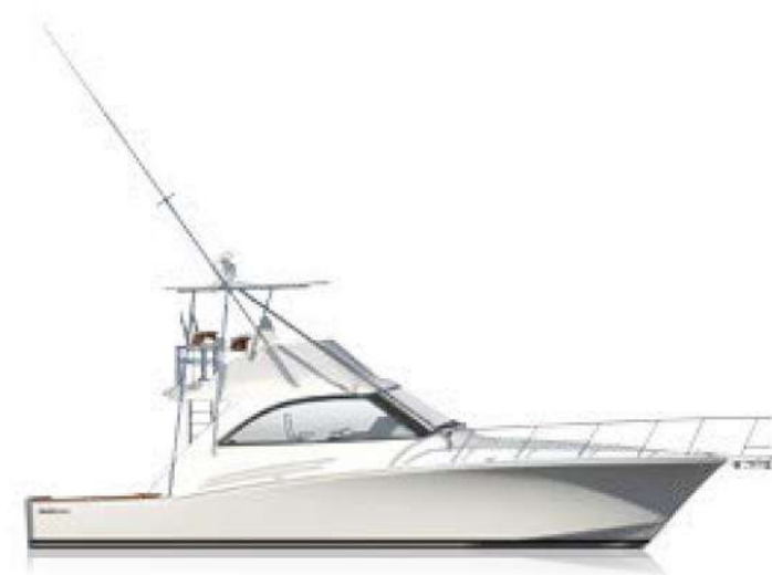
GT45X with Flybridge