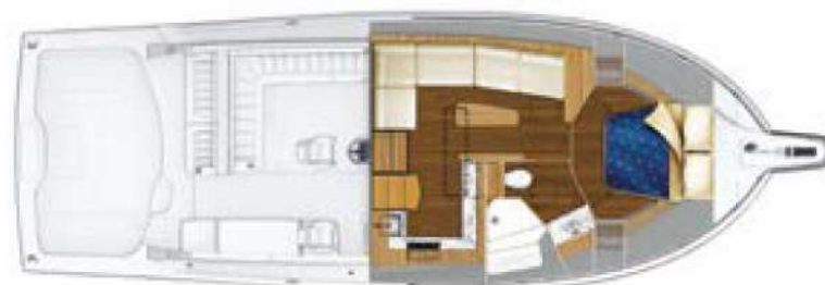
Main Cabin Standard Arrangement