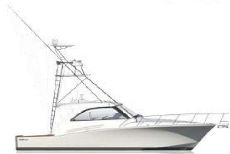
GT45X with Tower