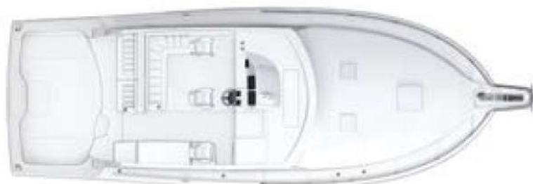
Helm Deck with Optional Third Helm Seat