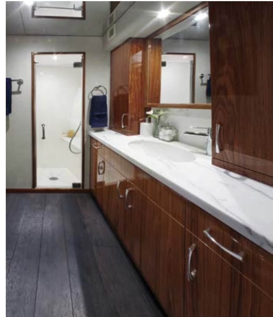
01. MASTER STATEROOM WITH QUEEN-SIZED BERTH AND EN-SUITE HEAD