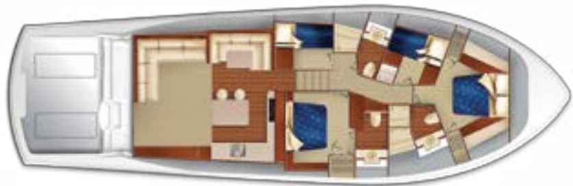
Standard 4-Stateroom / 3-Head Arrangement