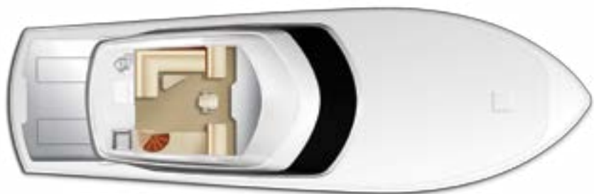
Enclosed Flybridge with Interior Stairwell to Salon Arrangement