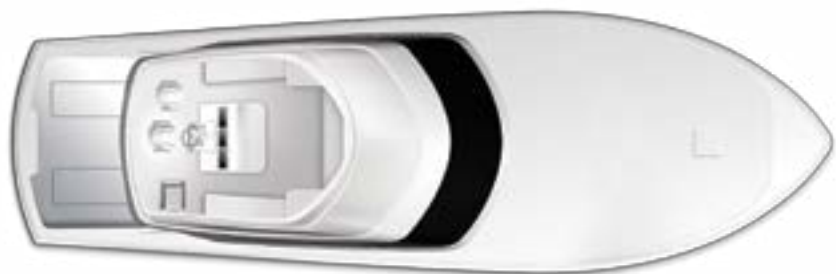
Standard Flybridge Arrangement