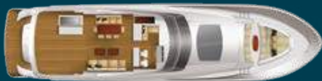
Standard Flybridge Arrangement