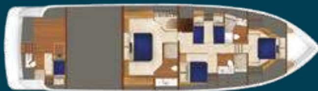
Lower Deck Arrangement