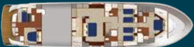
Lower Deck Arrangement