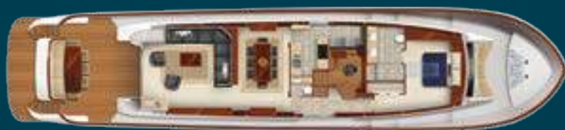
Main Deck Arrangement with Optional On-Deck Master Suite