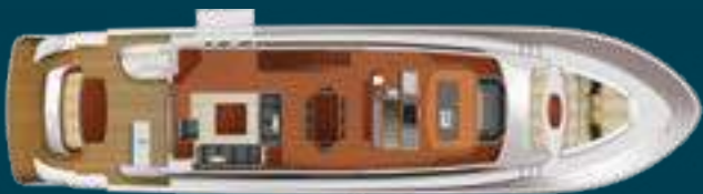
Main Deck Arrangement with Custom Fold-Down Balcony