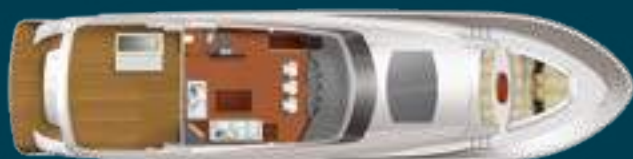
Enclosed Flybridge Arrangement