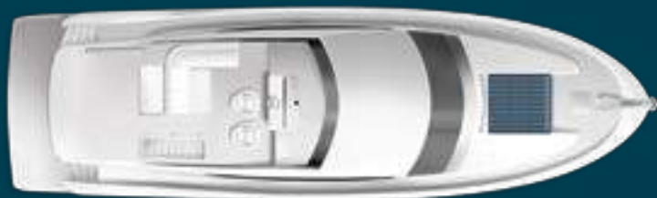
Standard Flybridge Arrangement