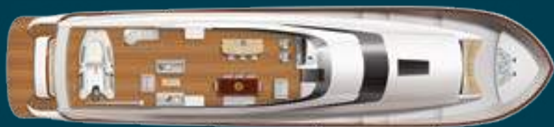
Flybridge Option with Davit