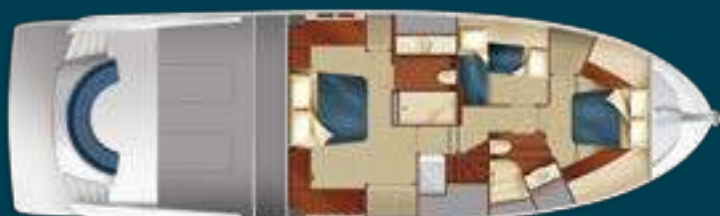
Lower Deck Standard Arrangement