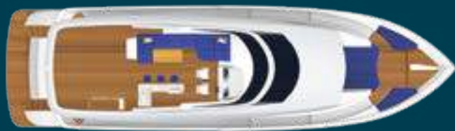
Standard Flybridge Arrangement