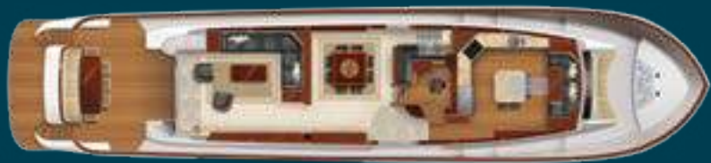
Main Deck Arrangement