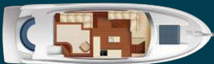
Main Deck Standard Arrangement