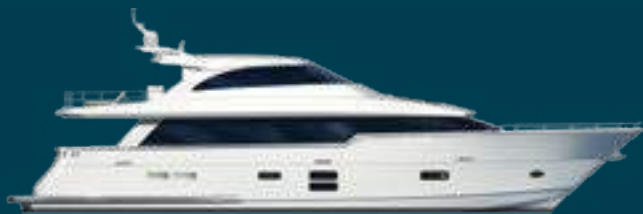
The M90 Panacera is also available with an enclosed flybridge.