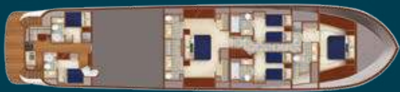
Lower Deck Arrangement