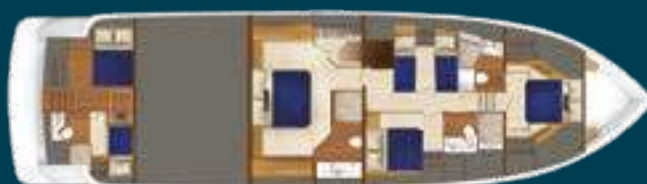
Lower Deck Arrangement with Optional Crew Quarters