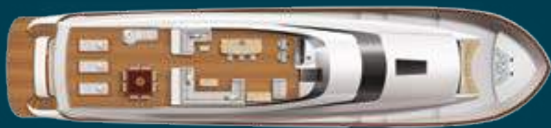
Standard Flybridge Arrangement