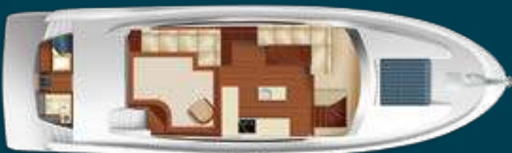
Main Deck with Crew Quarter Option