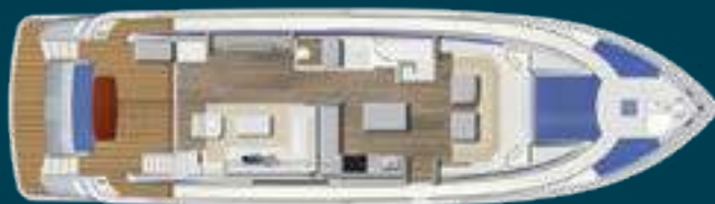
Main Deck Standard Arrangement