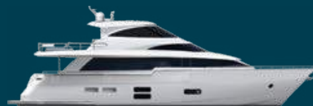
The M75 Panacera is also available with an enclosed flybridge.