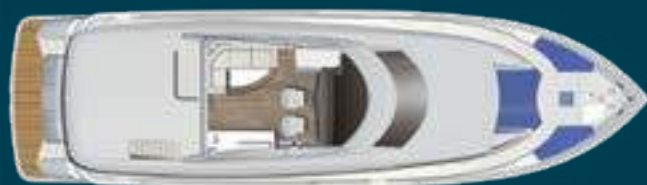
Enclosed Flybridge Arrangement