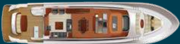
Main Deck Arrangement